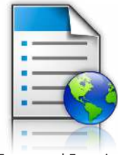
Forms and Favorites

Display Customisation: Display a customised, scrolling slideshow on the colour touch screen to communicate important messages to users while the printer is in sleep mode.