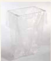
Optional features 20706 Waste bags