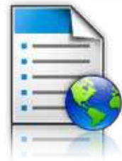
Forms and Favorites

Display Customisation: Display a customised, scrolling slideshow on the colour touch screen to communicate important messages to users while the printer is in Power Saver mode.